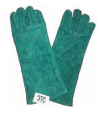
DTC-304 G Full Split Leather Green color With lining Inside . Size 16 Inches & 14 Inches