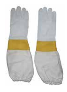
DTC-BG001 Goate Skin Leather With Cotton Jeans On Cuf With Honey Bee Mesh