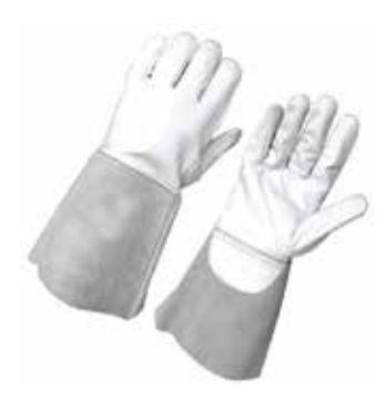
DTC-307 A 02 Tig Welding Gloves, Goat Skin Palm Split Leather Cuff.