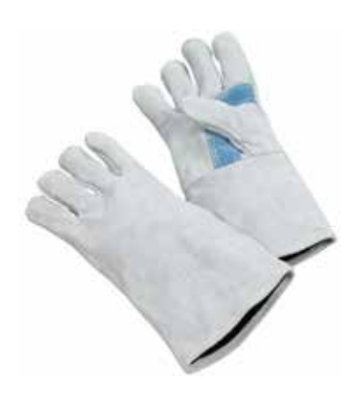
DTC-303 S Selected Cow Hide Split Welding \Gloves With Full Lining , Full Welted Seam, Reinforced Palm, Size 16 Inches