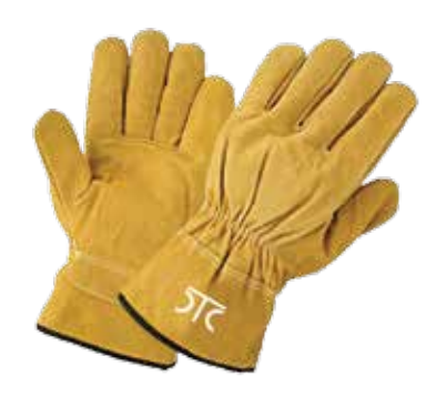
DTC-308 A Full Cow Hide Split Leather Selected Grain Cotton Cloth Lining Inside