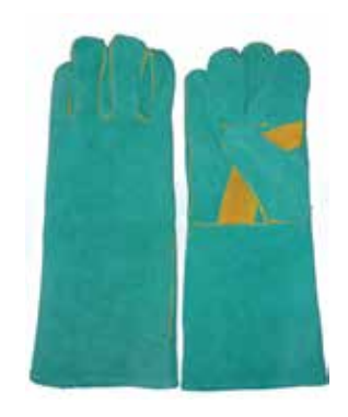
DTC-303 Cow Hide Split Welding Gloves With Full Lining ,Full Welted Seam, Reinforced Palm, Size 16 Inches