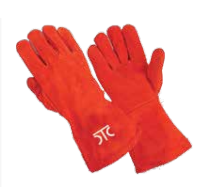
DTC-304 Full Split Leather Red Color With Full Lining Inside. Size 16Inches & 14 Inches.