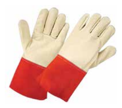
DTC-305 A Tig Welding Gloves, Goat Skin Palm Rust Color Split Leather Cuff.