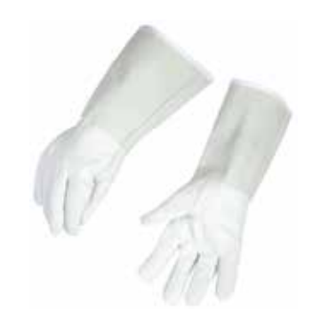
DTC-402 Super Quality Selected Cow Hide Full Leather Palm With Cowhide Cuff.