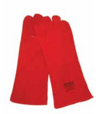
DTC-304 S Super Quality Full Split Leather, Red Color With Lining Inside. Size 16 Inches & 14 Inches