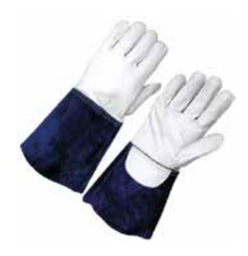
DTC-307 A Tig Welding Gloves, Goat Skin Palm Rust Color Split Leather Cuff.