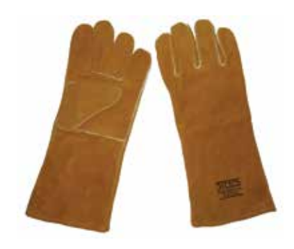
DTC-404 TSW Super Quality Full suede Leather Red color With lining Inside . Full Welted Seam.Size 16 Inches & 14 Inches