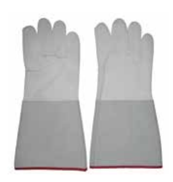
DTC-TW 305 KS Tig Welding Gloves, Goat Skin Palm, Split Leather Cuff, Kevlar Thread Seam