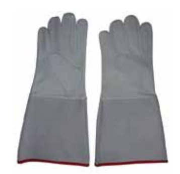
DTC-TW 305 Tig Welding Gloves, Goat Skin Palm, Split Leather Cuff.