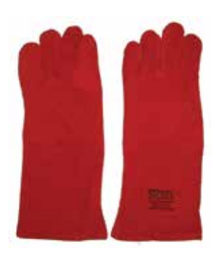
DTC-404 D Standred Quality Full Split Leather, Red Color With Lining Inside. Size 16 Inches & 14 Inches