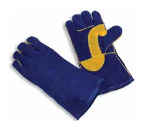
DTC-303 A Sapphire Blue Cowhide Split Welding Gloves With Full Lining and Full Welted Seam, Reinforced Thumb and Palm Wing Thumb, Size 16 Inches.