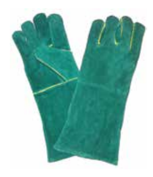
DTC-304 TG Full Split Leather Green color With lining Inside . Full Welted Seam.Size 16 Inches & 14 Inches