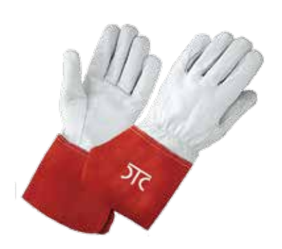
DTC TW 305 A 02 Tig Welding Gloves, Goat Skin Palm Rust Color Split Leather Cuff.