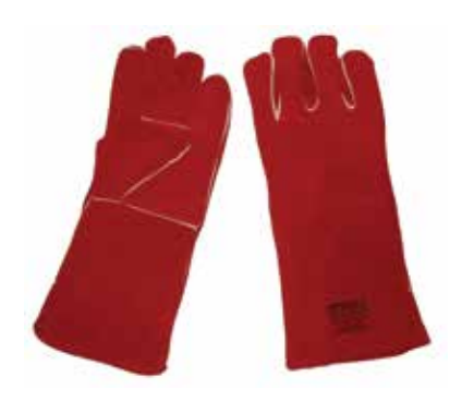
DTC-404 TS Super Quality Full Split Leather Red color With lining Inside . Full Welted Seam.Size 16 Inches & 14 Inches