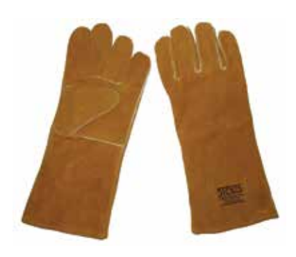
DTC-404 TSW Super Quality Full suede Leather Red color With lining Inside. Full Welted Seam.Size 16 Inches & 14 Inches