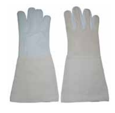
DTC-TW305C Goat Skin Leather Palm With Cototon Cloth Back And Cuff.