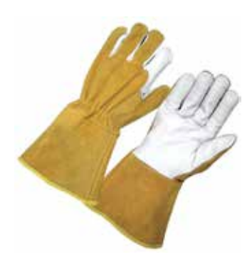
DTC-313 Goat Skin Leather Palm And Full Split Leather Super Quality Back