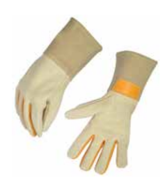
DTC-402 P Super Quality Selected Cow Hide Full Leather Palm With Cowhide Cuff.