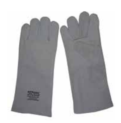
DTC-304 A Full Split Leather, Grey Color With Lining Inside. Size 16 Inches & 14 Inches.