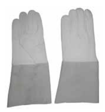
DTC-TW 306 Tig Welding Gloves, Goat Skin Palm, Split Leather Cuff.