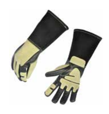
DTC-402 SP Super Quality Selected Cow Hide Full Leather Doubble Palm with Cowhide Split Leather Cuff