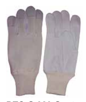
DTC-G 320 Goat Made Of Goat Skin Leather Palm , Cotton Cloth Back, Knitted Elasticated Cuff.