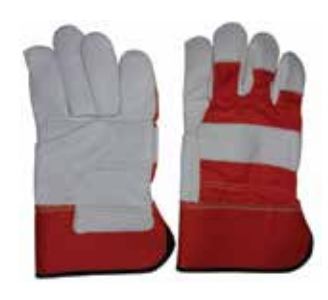
DTC-808 P First Quality, Split Leather Doubble Palm, Yellow Drill Cloth Back,Cotton Lining Inside Elastic Tensioner, Rubberised Safety Cuff, Also Available In Green And Red Cloth