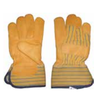
DTC-1406 Made Of Real Leather With Cotton Lining Inside , Drill Cloth Used On Back.