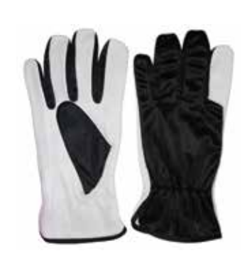
DTC-G571 Sheep Made Of Sheep Ski Palm, Black Polyester Trinda on Back, Elastic Tensioner. Cloth Also Available In Other Color