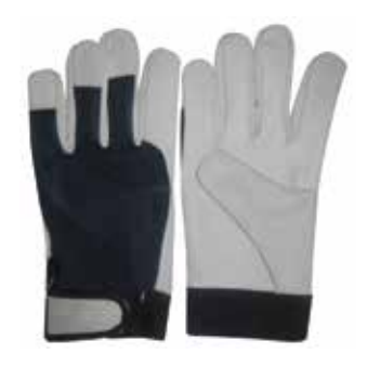
DTC-DL-04 Made Of Goat Leather Palm, Black Polyester Trinda on Back, Elastic Cuff With Velcro Closing. Cloth Also Available In Other Color