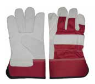
DTC -707 C Normal C Quality Split Leather Palm, Standard Cotton Cloth Back, Elastic Tensioner, Rubberized Safety Cuff, Also Available In Yellow,Red & Green Color,Size 10"