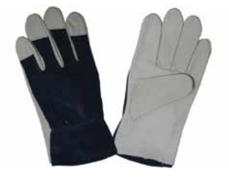
DTC-311 S 3 Made Of Goat Leather Palm, Black Cotton Back. Also Available In Other Colors.