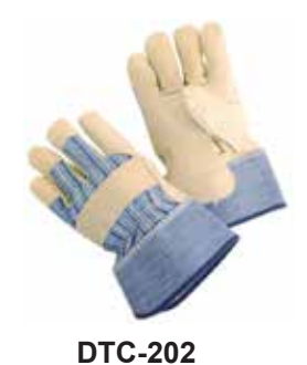
Heavy Duty Super Grade Selected Leather Palm, Drill Cloth Back with Lining Inside, Elastic Tensioner ,Knuckle Strap Back, Rubberized Safety Cuff, Size 10.5 Inches