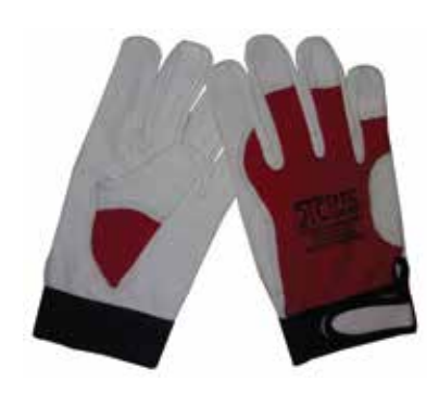
DTC-561 Made Of Goat Leather Palm, Red Spandex Back, Elastic Cuff With Velcro Closing. Cloth Also Available In Other Color