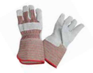
DTC-202 S Heavy Duty Super Grade Selected Grey Side Split Leather Palm, Drill Cloth Back with Lining Inside, Elastic Tensioner ,Knuckle Strap Back, Rubberized Safety Cuff, Size 10.5 Inches