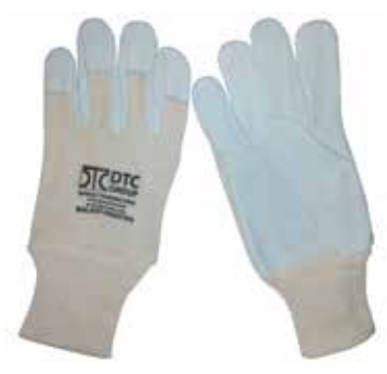
DTC-310 SH Made Of Sheep Skin Leather Palm, Cotton Cloth Back, Knitted Elasticated Cuff.