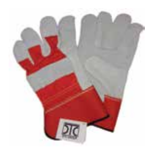
DTC-707 B Normal B Quality Split Leather Palm, Standard Cotton Cloth Back, Elastic Tensioner, Rubberized Safety Cuff,Also Available In Yellow, Red & Green Color.Size 10"