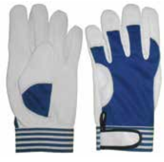
DTC-G 540 S Made Of Blue Fourway On Back And Goat Leather Front Palm, Elastic Cuff With Velcro Closing.