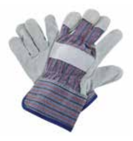
DTC-909 S Heavy Duty Super Grade Selected Grey Side Split Leather Palm, Drill Cloth Back with Lining Inside, Elastic Tensioner ,Knuckle Strap Back, Rubberized Safety Cuff, Size 10.5 Inches