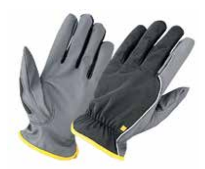
DTC-M 523 Made Of Micro Fabric Back, Serino On Front Palm, Elastic Tensioner.