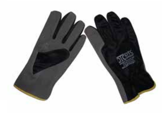
DTC-M 593 02 Made Of Syenthetic Leather Palm, Black Polyester Trinda on Back, Elastic Tensioner . Cloth Also Available In Other Color