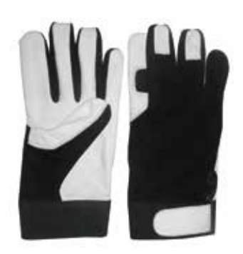
DTC-G 541 S Made Of Black Fourway On Back And Goat Leather Front Palm, Elastic Cuff With Velcro Closing.