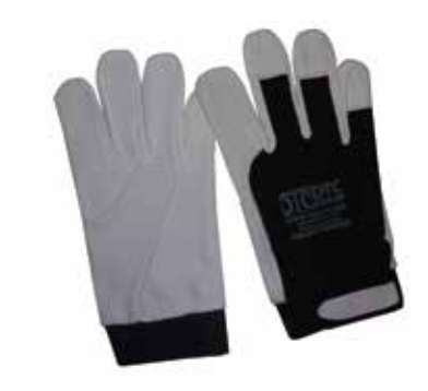
DTC-571 Made Of Goat Leather Palm, Red Rib Back, Elastic Cuff With Velcro Closing. Cloth Also Available In Other Color