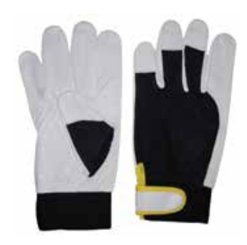
DTC-317 Made Of Goat Leather Palm, Black Polyester on Back, Elastic Cuff With Velcro Closing. Cloth Also Available In Other Color