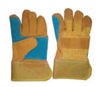
DTC-1110 P Standred Quality Split Leather Doubble Palm And Cloth Back,Rubberized Safety Cuff,Also Available In Multi Colors