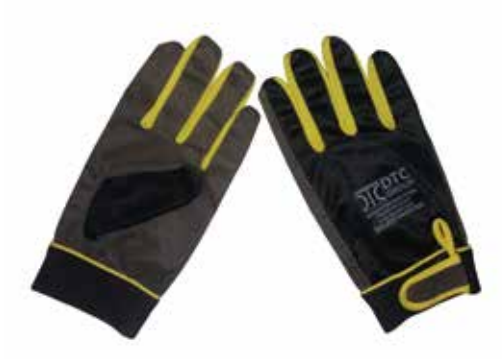
DTC-M 592 2 Made Of Syenthetic Leather Palm, Black Polyester Trinda on Back, Elastic Cuff With Velcro Closing. Cloth Also Available In Other Color