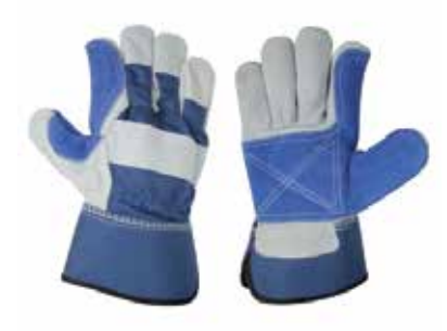
DTC-808 A 02 First Quality, Split Leather Doubble Palm, Yellow Drill Cloth Back, Cotton Lining Inside Elastic Tensioner, Rubberised Safety Cuff, Also Available In Green And Red Cloth