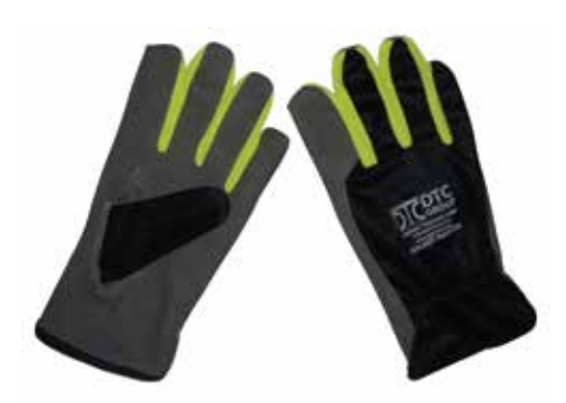
DTC-330 Made Of Syenthetic Leather Palm, Black Polyester Trinda on Back, Elastic Tensioner . Cloth Also Available In Other Color