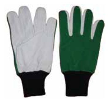
DTC-G 321 Sheep Made Of Sheep Skin Leather Palm , Cotton Cloth Back, Knitted Elasticated Cuff.