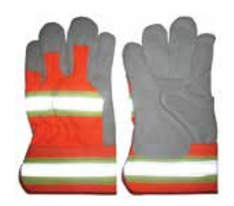
DTC-1010 Split Leather Palm , High Visibility Back with 3M Reflective Tape