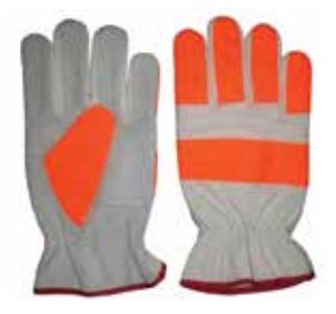
DTC-1405 Made Of High Quality Split Leather Doubble PalmWith High viz Strap On Back,Elastic Tensioner.