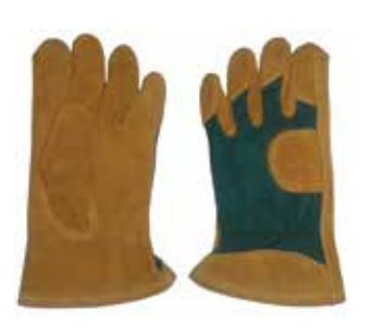
DTC-1011 Made Of Standered Quality Split Leather With Micro Fabric Back, Elastic Tensioner.