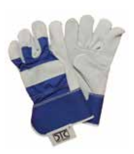
DTC-909 02 Heavy Duty Super Grade Selected Grey Side Split Leather Palm, Jeans Cloth Back with Lining Inside, Elastic Tensioner, Knuckle Strap Back, Rubberized Safety Cuff, Size 10.5 Inches