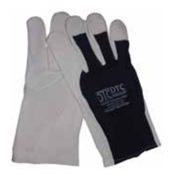
DTC-311 S 2 Made Of Goat Leather Palm, Black Cotton Back. Also Available In Other Colors.