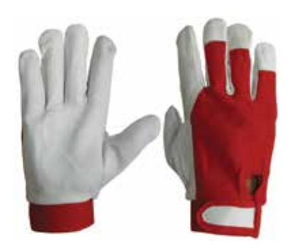
DTC-311 A Made Of Goat Leather Palm, Red Cotton Back, Elastic Cuff With Velcro Closing. Cloth Also Available In Other Color