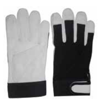
DTC-DL 03 A Made Of Goat Leather Palm, Black Fourway Spandex on Back, Elastic Cuff With Velcro Closing. Cloth Also Available In Other Color