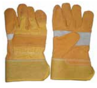
DTC-1009 P Standred Quality Split Leather Doubble Palm And Cloth Back, Rubberized Safety Cuff, Also Available In Multi Colors