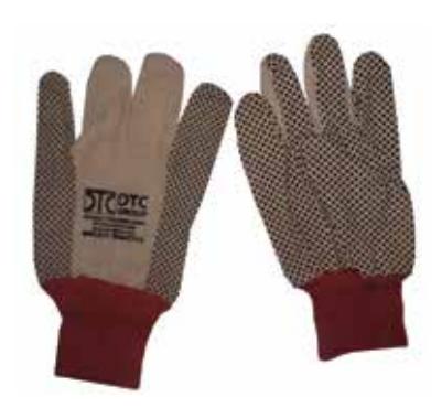
DTC-606 D Made Of Dotted Cotton Fabric Seam Less Glove. Also Can Use As Inner.